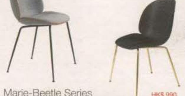
Marie-Beetle Series HK$ 990