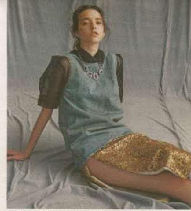
Necklace in platinum with diamonds and sapphires (HK$7.9 million) by Tiffany & Co. Lierre de Paris ear studs in white gold with diamonds (HK$92,000) by Boucheron. Denim dress (HK$9,700), black polo shirt (HK$10,500) and sequin dress (HK$90,250), all by Miu Miu. For the rest of this week's fashion shoot, go to page 24.

The main character's personal trajectory mirrors that of his vast nation, as it clammers from poverty to untold riches, jumps from Mao Zedong to Deng Xiaoping, from collectivisation to land reform, from the Cultural Revolution to getting rich fast. — James Kidd's review of Jiang Zilong's Empires of Dust