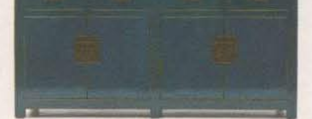
Nolinda Cabinet HK$ 8,290