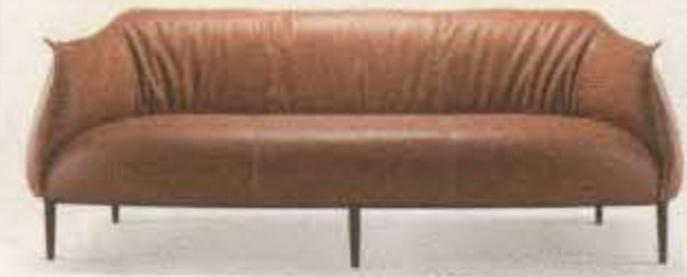
Cruzman Sofa HK$ 4,690