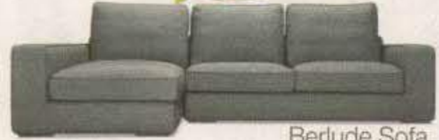
Berlude Sofa HK$ 13,990